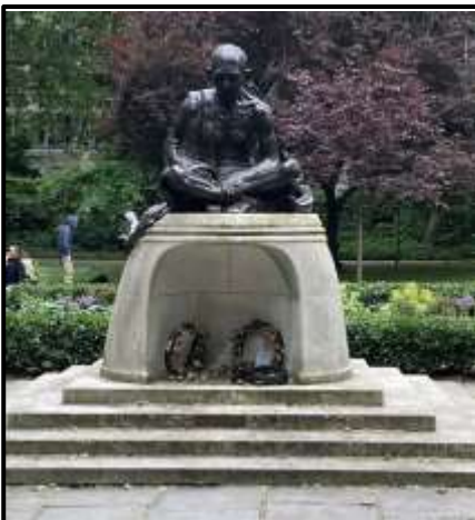
A statue of Mahatma Gandhi