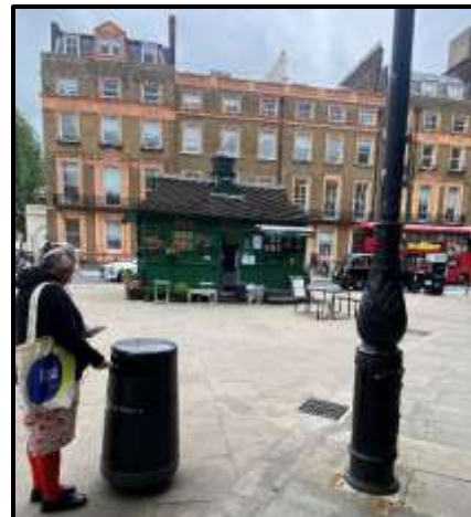
One of the last taxi drivers' shelters, now converted into a coffee shop